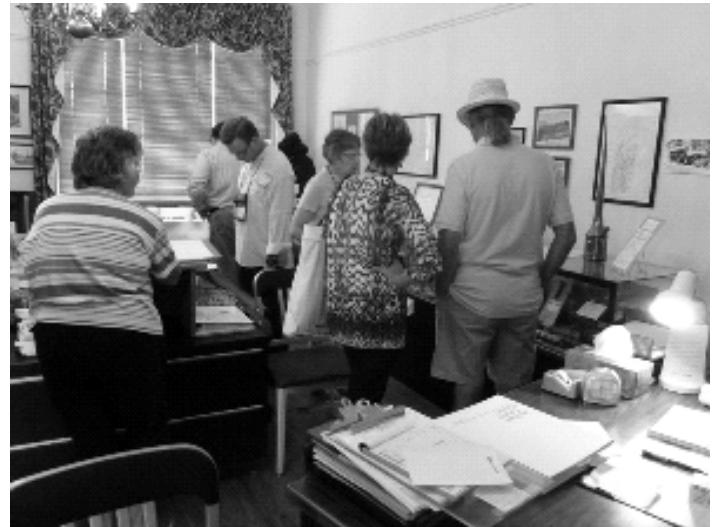
Germanna visitors at the Arcade

On Friday July 13 approximately 40 Germanna Reunion attendees came to Madison to see old family homes and land. Some of the families represented were Clore, Crigler, Weaver and Carpenter.