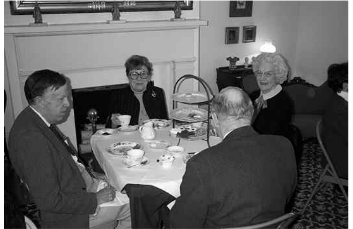
Enjoying tea at the Kemper House

Some new items have been added to the menu for the fall fundraising tea, to be held at the Kemper Residence Wednesday, September 24, at 12:30 p.m.